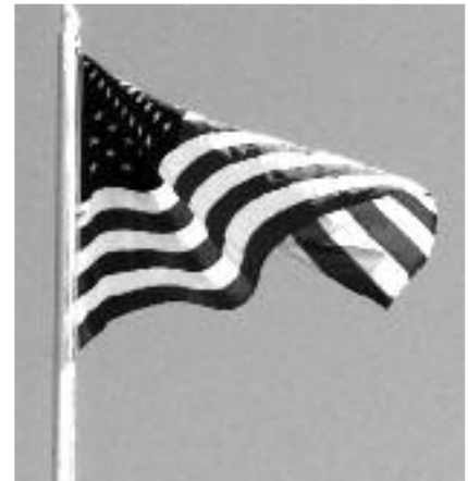
Garwood Custom Cycles donated flag