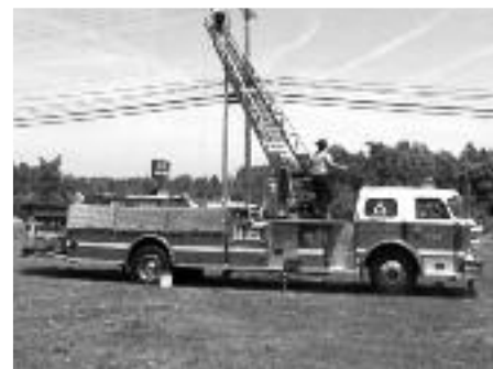
LFD lends a hand painting our Flag Pole