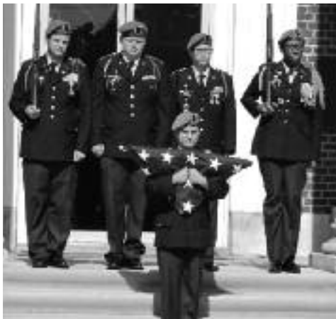
Central Davidson ROTC Color Guard Flag Ceremony