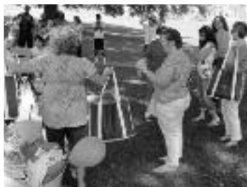
Fun in the Sun with our friends from La-Z-Boy