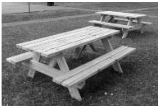
Building tables and sharing a meal with Wake the World