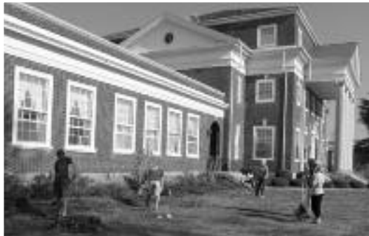
Sprucing up the front with Touching Davidson County With Love