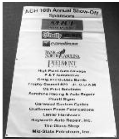
Our 2014 Show-Off Sponsors