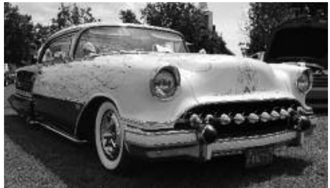
1955 Oldsmobile Super 88