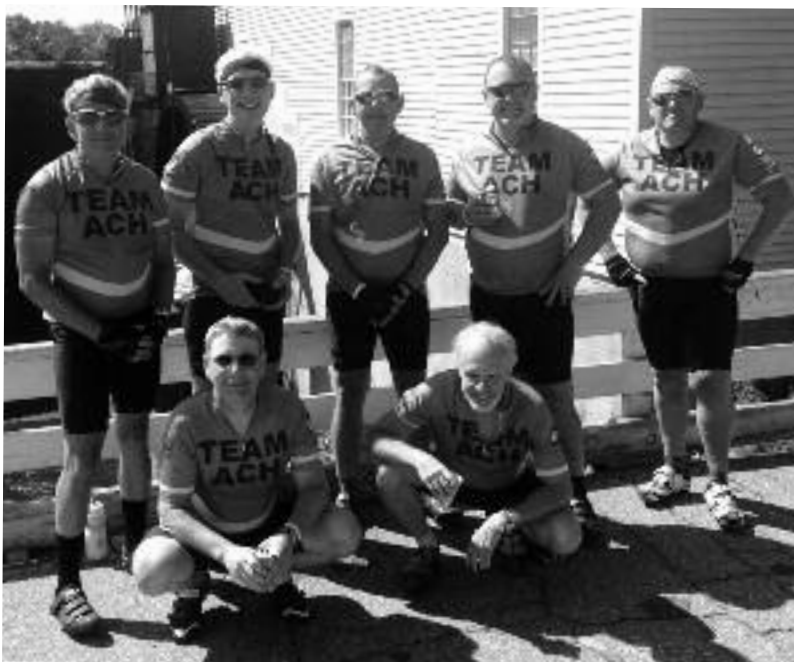
Team ACH-blue jersey

Riding from 65+ miles daily, the team will cover more than 500 miles. Each team member seeks sponsorships from friends, family members, local businesses and organizations to raise funds which help with renovations and general expenses for American Children's Home. Please join in supporting Team ACH with the "2014 Ride Across North Carolina". (Call 336-357-7126 for sponsorship information.)